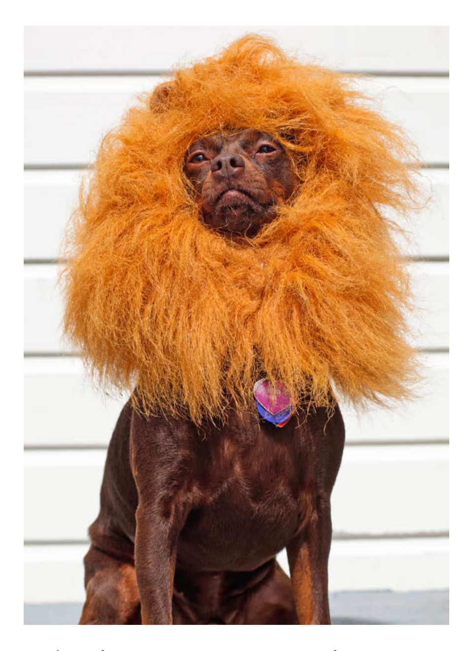
A dog can wear the mane of a lion.