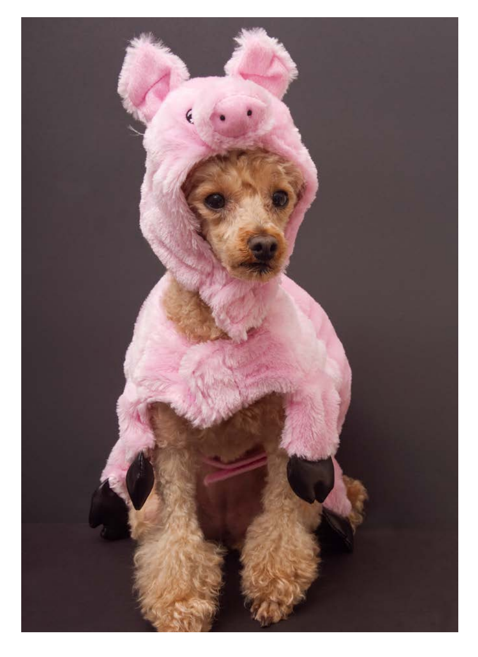
A dog can wear the snout of a pig.