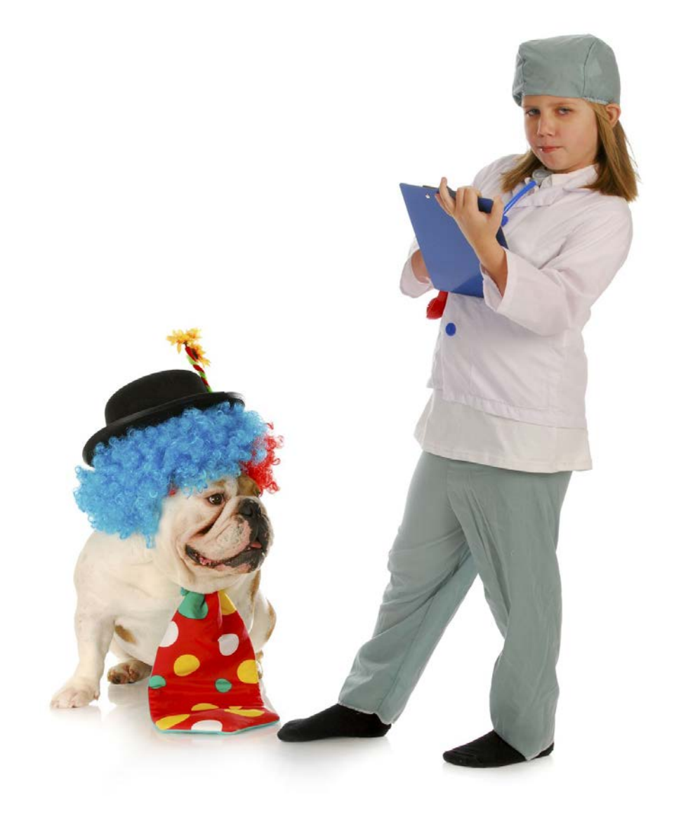
People wear costumes. Animals can wear costumes too.