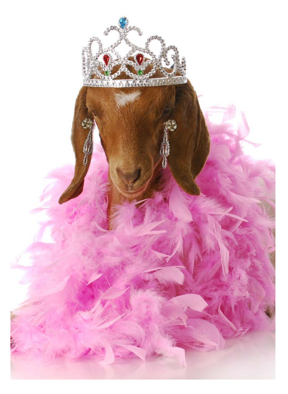
A goat can wear the crown of a princess.