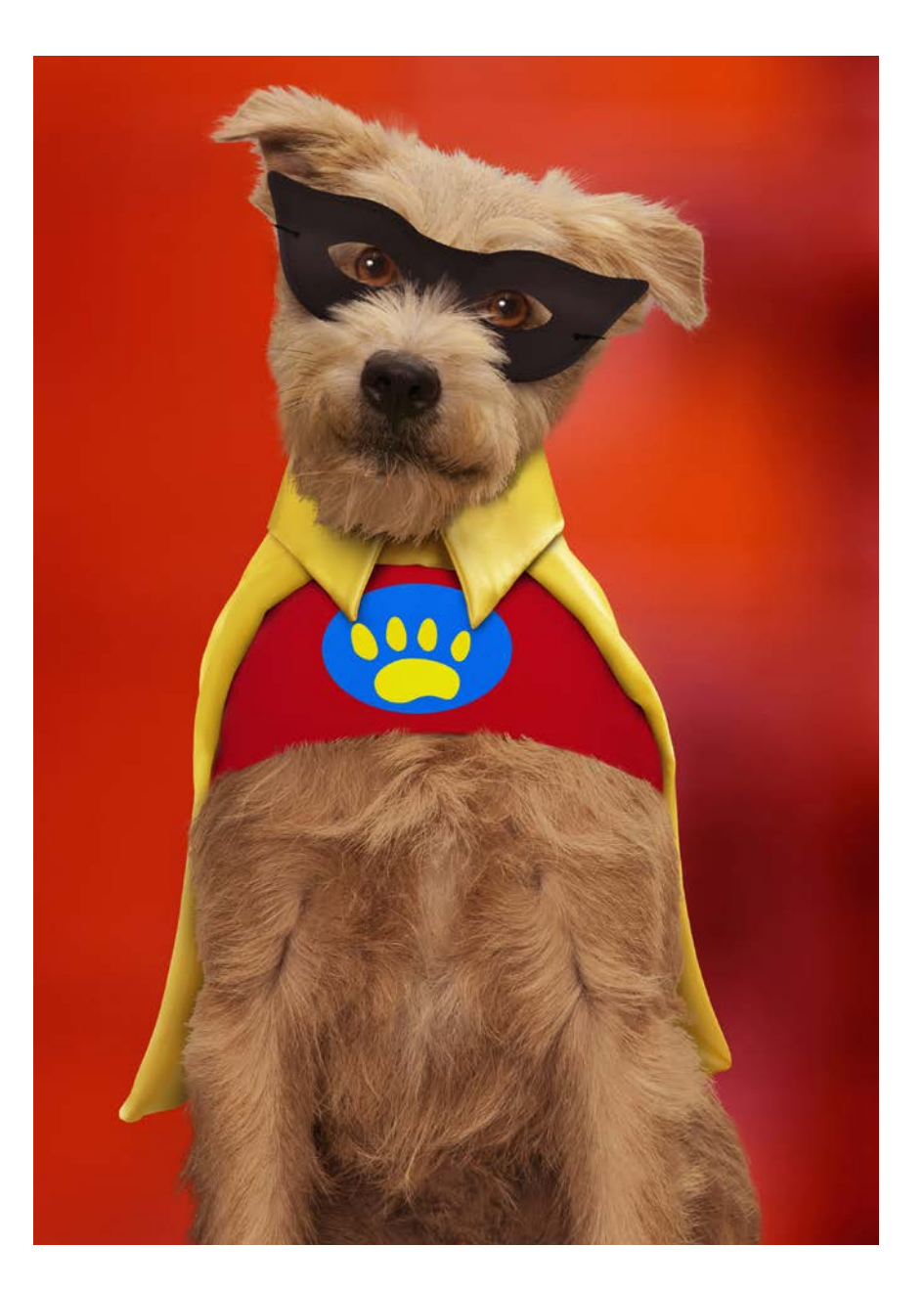
A dog can wear the mask of a superhero.