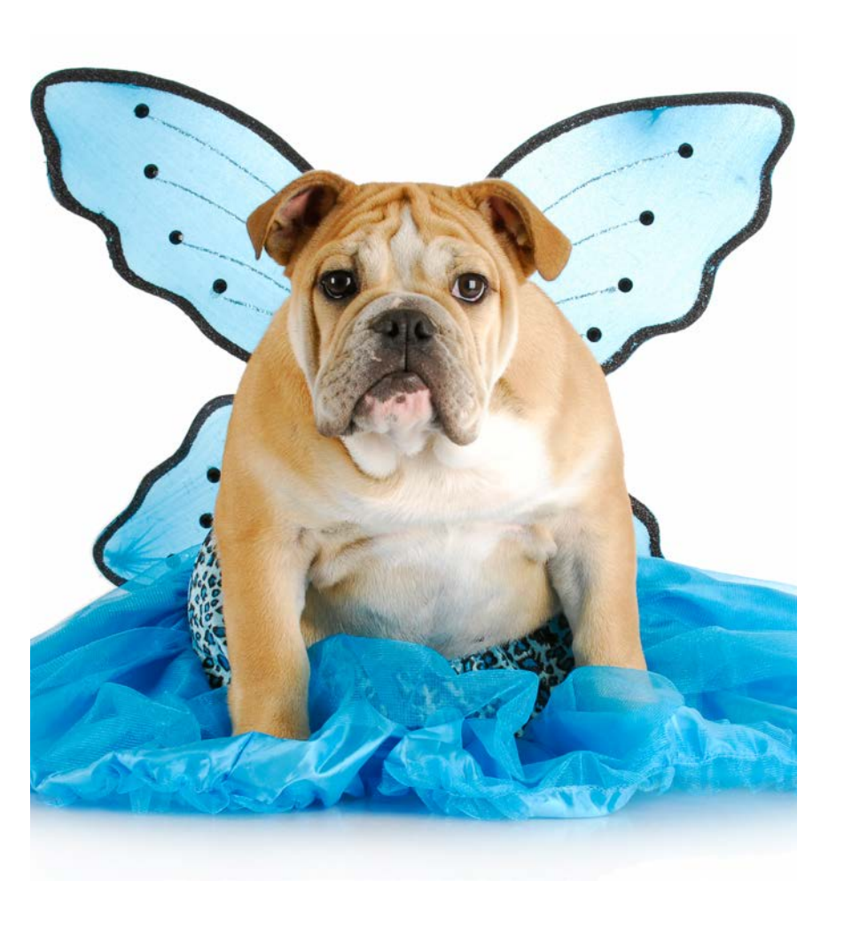
A dog can wear the wings of a butterfly.