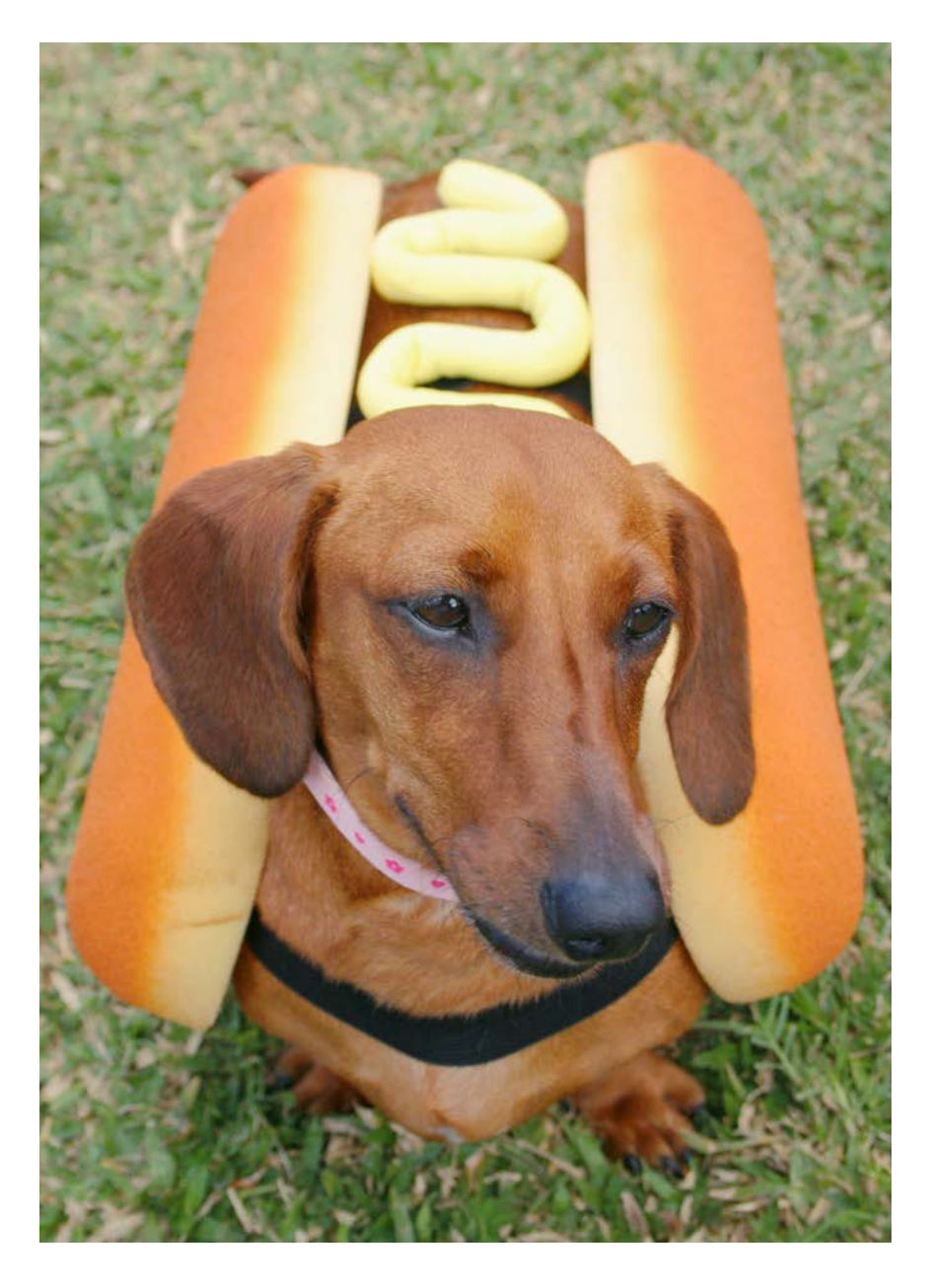
What costume is this dog wearing?