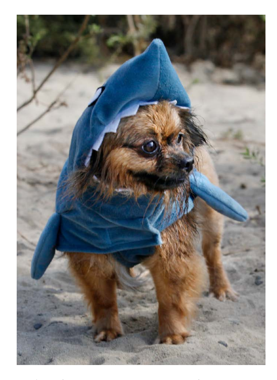
A dog can wear the fins of a shark.