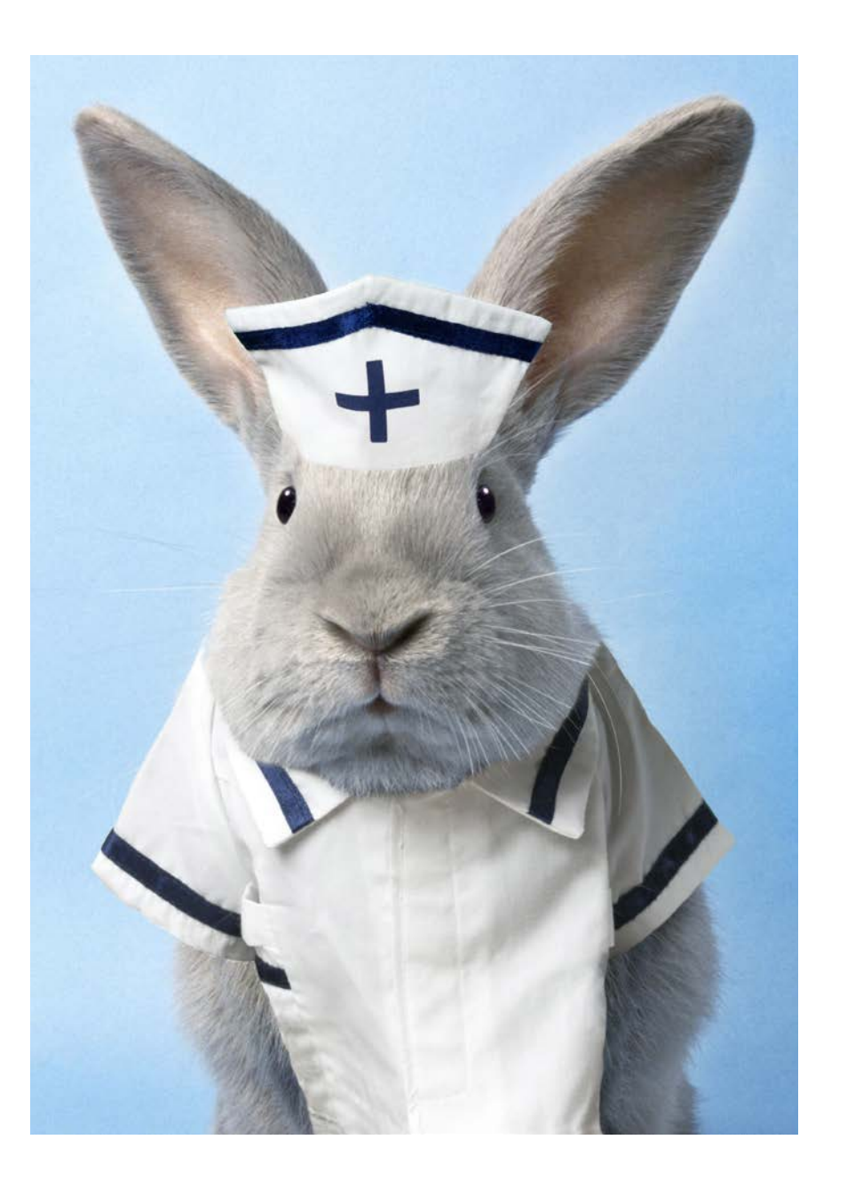
A rabbit can wear the hat of a nurse.